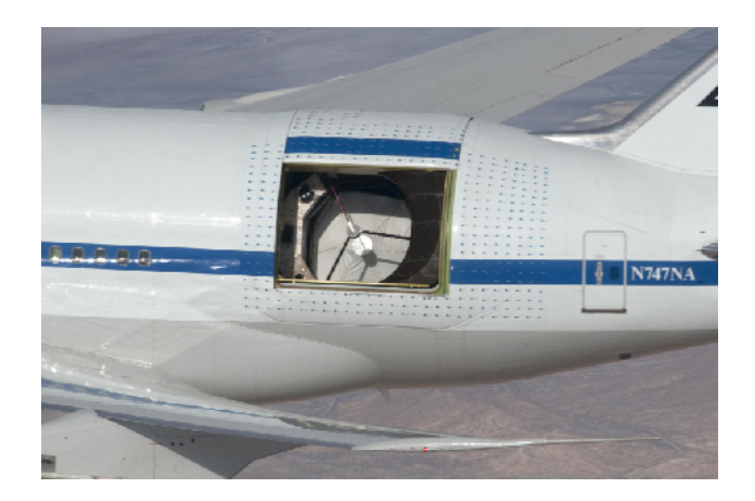
Figure 6.23 Stratospheric Observatory for Infrared Astronomy (SOFIA). SOFIA allows observations to be made above most of Earth's atmospheric water vapor.