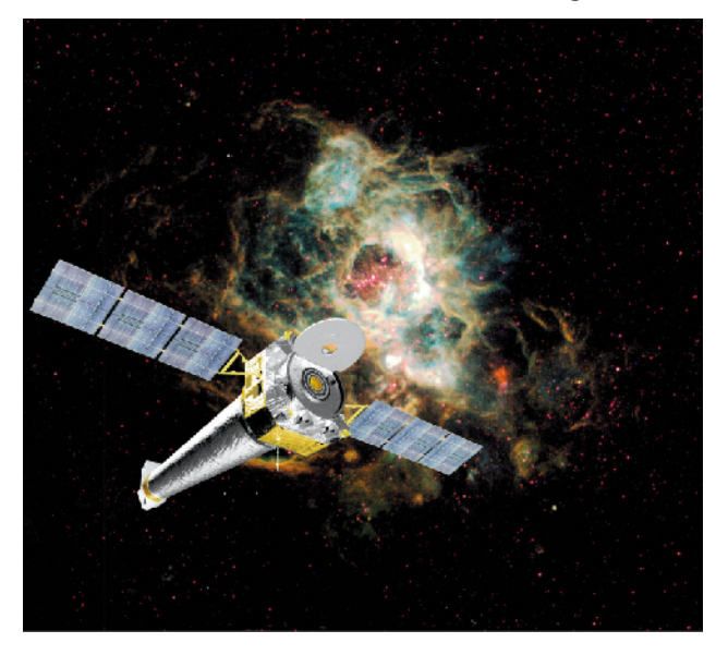
Figure 6.26 Chandra X-Ray Satellite. Chandra, the world's most powerful X-ray telescope, was developed by NASA and launched in July 1999.

is an enormous technological challenge. The 2002 Nobel Prize in physics was awarded to Riccardo Giacconi, a pioneer in the field of building and launching sophisticated X-ray instruments. In 2008, NASA launched the Fermi Gamma-ray Space Telescope, designed to measure cosmic gamma rays at energies greater than any previous telescope, and thus able to collect radiation from some of the most energetic events in the universe.