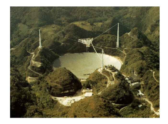
Figure 6.22 Largest Radio and Radar Dish. The Arecibo Observatory, with its 1000-foot radio dish-filling valley in Puerto Rico, is part of the National Astronomy and Ionosphere Center, operated by SRI International, USRA, and UMET under a cooperative agreement with the National Science Foundation.